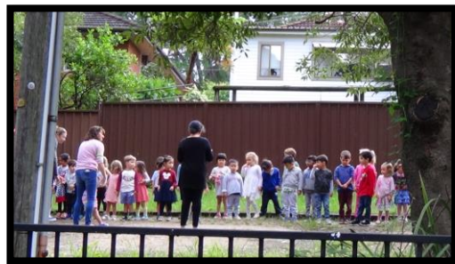
Fire drill practice